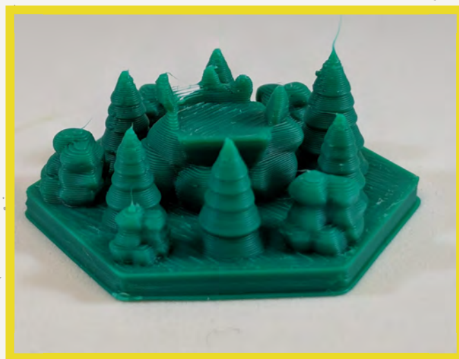
3D printed piece for the board game Terraforming Mars