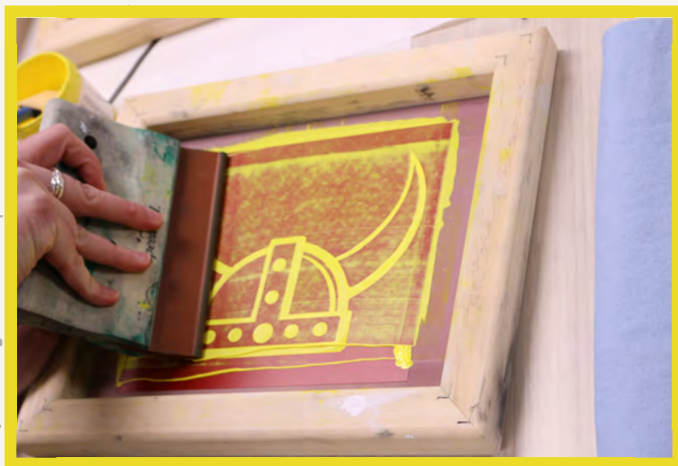
A shot from the screen printing workshop