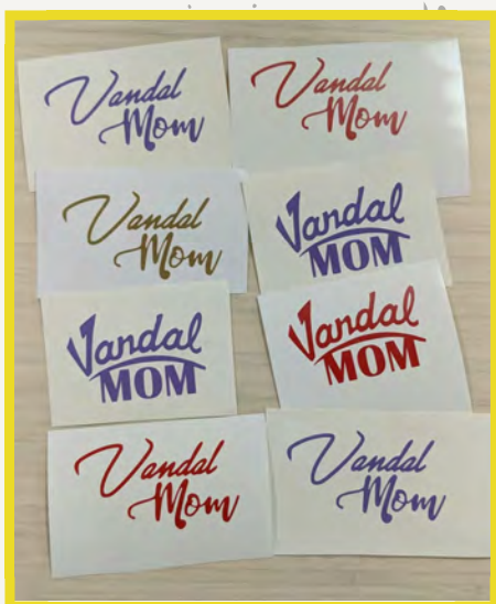
Stickers created for Mom's Weekend