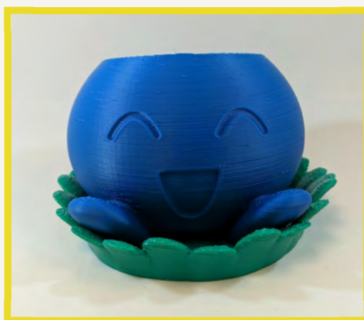
3D printed planter